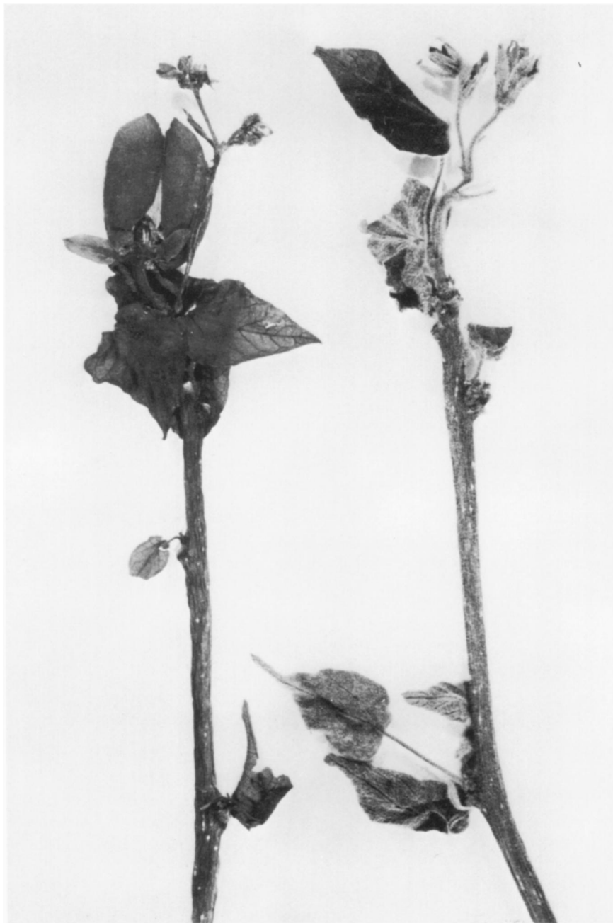
FIGURE 2. Photograph of type collection of Jatropha stevensii (Stevens 22902); left-hand glabrous branch with capsule and staminate flowers; right-hand pubescent branch with pistillate flowers.

(Nicaragua), and J. costaricensis Webster & Poveda (Guanacaste, Costa Rica). These species belong to two different subgenera and sections, J. podagrica in subg. Jatropha sect. Peltatae and J. stevensii and J. costaricensis in subg. Curcas sect.