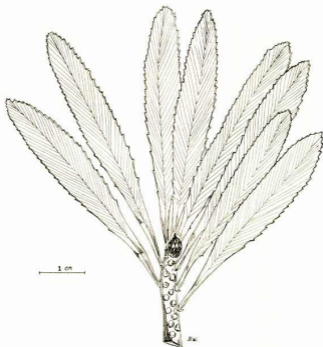
FIG. 1. Vegetative branch of Phyllanthus eximius .

Extensive collections of members of this group were made in Jamaica, Puerto Rico, and Guadeloupe. However, the analysis of several of the species (such as P. arbuscula and P. epiphyllanthus ) is still not complete